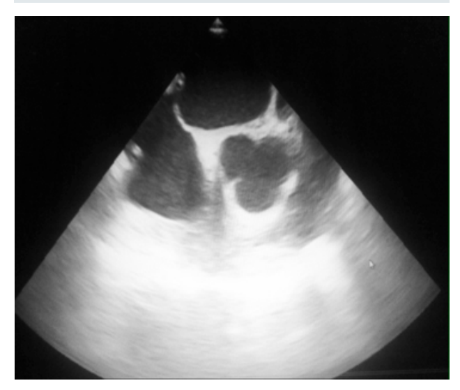
Figure 4. Perioperative TEE Image After From Right Atrial Myxoma Resection Video 3. Perioperative Moving TEE Image After From Right Atrial Myxoma Resection